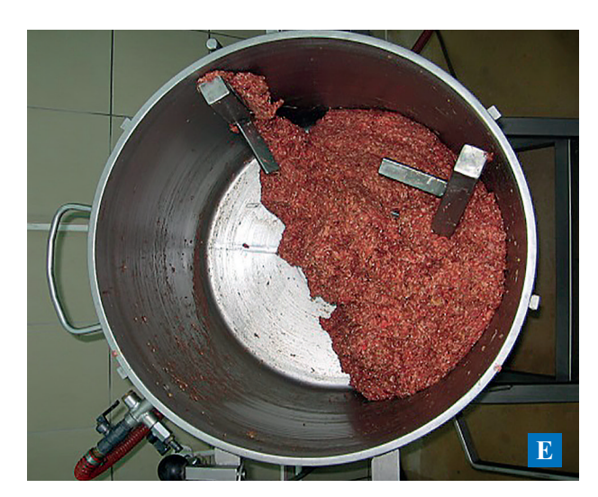
Figure 1. Traditional, manual (C) and mechanical (E) mixing of Petrovská klobása